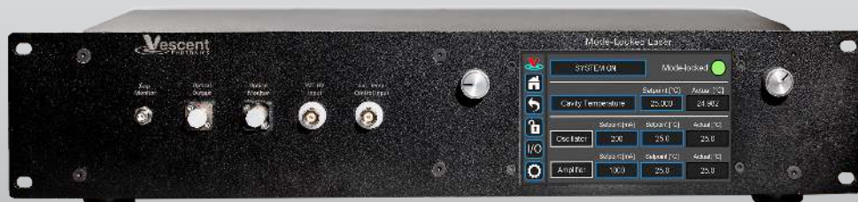
MLO-100 Mode-Locked Oscillator