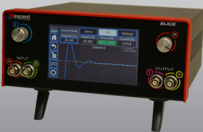
SLICE-QT temperature controller

With compliance voltages up to 18 V and current outputs up to 6 A, our proprietary low-noise power supply technology makes it easy to control a variety of different plants.