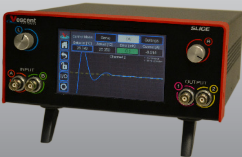
SLICE-QTC temperature controller

With compliance voltages up to 18 V and current outputs up to 6 A, our proprietary low-noise power supply technology makes it easy to control a variety of different plants.