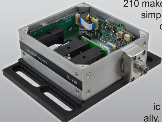
D2-210 Spectroscopy Module

Vescent Photonics' D2-210 second-generation Spectroscopy Module makes locking to atomic transitions easier and more powerful than ever before. Completely redesigned to maximize performance in a number of laser-locking environments, the D2-210 makes atomic absorption-referenced frequency locks simple. Designed to work as a general-purpose frequency discriminator, it is compatible with our D2-125 Reconfigurable Servo as well as other feedback loop filters.