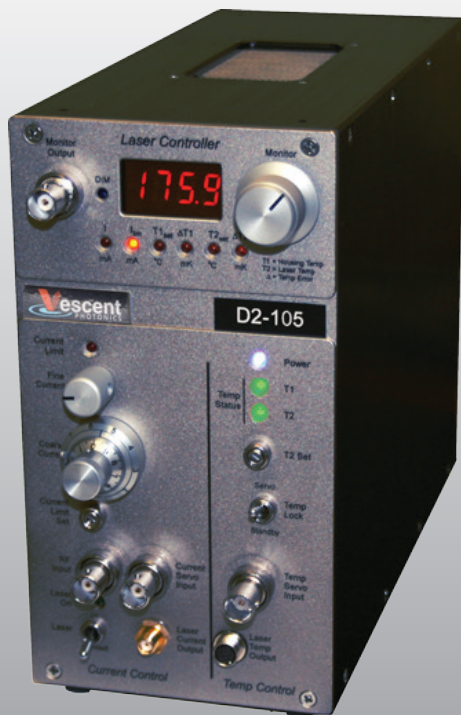
D2-105 Laser Controller

The D2-105 is a complete diode laser controller, including low-noise current controller, temperature control, and modulation input. The precision laser current source is based on the Libbrecht-Hall* circuit, well-known to be the lowest-noise design available. Two stages of temperature control provide long-term frequency stability. Front-panel BNC ports enable both high-speed (>10 MHz) servo control of the laser frequency and RF modulation directly to the laser current output SMA. Powered with the D2-005 linear power supply.