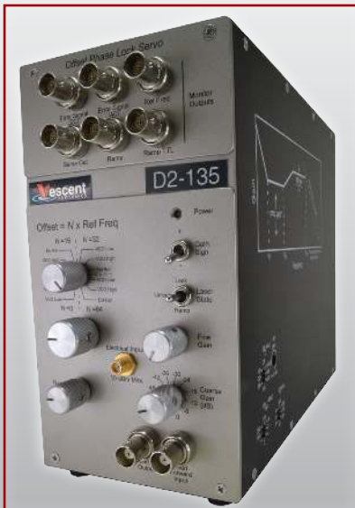
D2-135 Offset Phase Lock Servo

The D2-135 Offset Phase Lock Servo is designed to precisely control and quickly adjust the frequency detuning between two lasers. Broad, rapid detuning of the slave laser is possible via a phase/frequency detector and an adjustable-parameter PID loop filter.