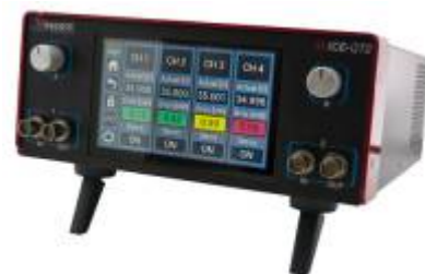
Fig. 1: The SLICE-QT

The SLICE-QT is a high-precision temperature controller (see figure 1 ). It will control up to four thermal plants with sub-millikelvin precision.