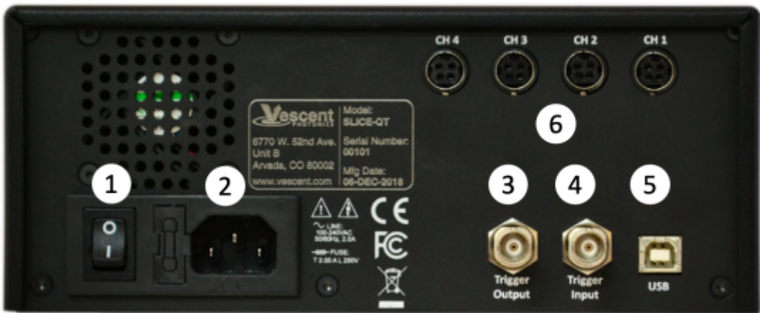
Fig. 3: View of rear of SLICE-QT

Contact sales [at] vescent [dot] com for questions and corrections, or to request added functionality.