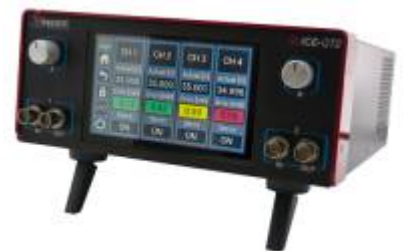
Fig. 1: The SLICE-QT

The SLICE-QT is a high-precision temperature controller (see figure 1 ). It will control up to four thermal plants with sub-millikelvin precision.