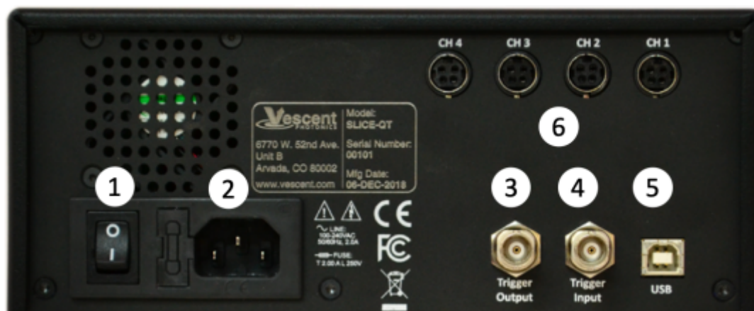
Fig. 3: View of rear of SLICE-QT

Contact sales [at] vescent [dot] com for questions and corrections, or to request added functionality.