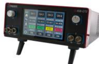
Fig. 1: The SLICE-QT

The SLICE-QT is a high-precision temperature controller (see figure 1 ).