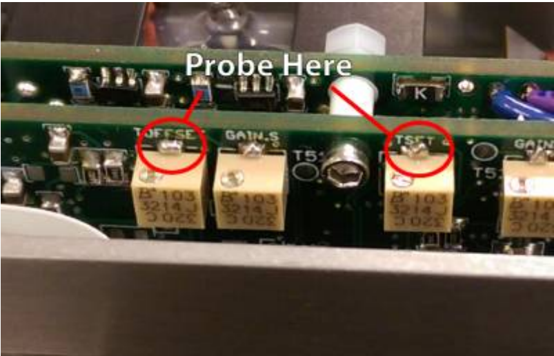
Fig. 4: Locations to probe with voltmeter while adjusting trimpots.

The extent of the trim range can be determined by probing the location shown in figure 4 with a voltmeter referenced to case ground (the outer shell of the SMA connector is a good reference point). Probing this location gives the wiper voltage of the trimpot which corresponds to temperature as shown in the table below. This 10-turn trim pot sets temperature from 15°C (fully CCW) to 75°C (10 turns CW). The 5-turn point is approximately 42°C. The following table gives approximate temperature settings for the three available alkali options: