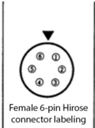
Fig. 2: Pin numbering on female Hirose 6-pin connector

Power from the D2-005 Power Supply, ICE-PB1 Power Buss, or other power supply are made through a Hirose 6-pin circular connector ( HR10A-7TR-6SA ) shown in figure 1 and figure 2 . The pin definitions (pin numbers are marked on the connectors) are listed in table 1 .