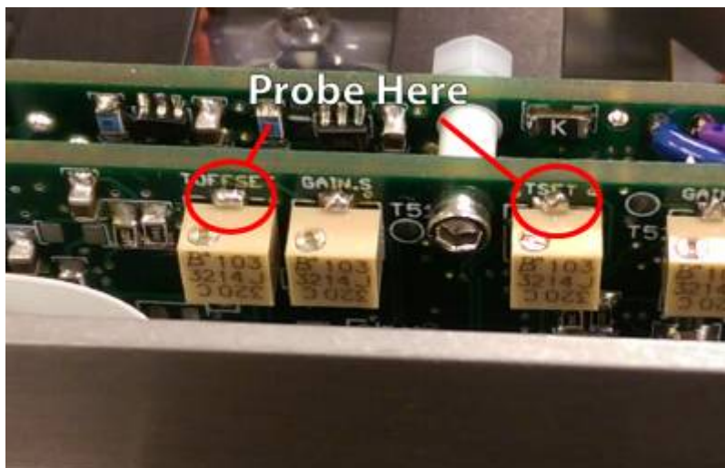
Fig. 4: Locations to probe with voltmeter while adjusting trimpots.

The extent of the trim range can be determined by probing the location shown in figure 4 with a voltmeter referenced to case ground (the outer shell of the SMA connector is a good reference point). Probing this location gives the wiper voltage of the trimpot which corresponds to temperature as shown in the table below. This 10-turn trim pot sets temperature from 15°C (fully CCW) to 75°C (10 turns CW). The 5-turn point is approximately 42°C. The following table gives approximate temperature settings for the three available alkali options: