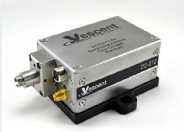
D2-212 Spectroscopy Module