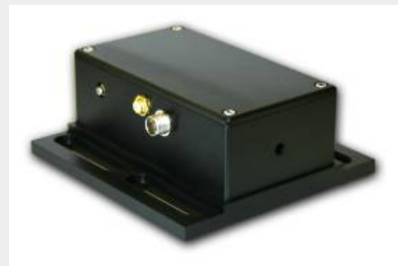
D2-110 Spectroscopy Module

Please read Limited Warranty and General Warnings and Cautions prior to operating the D2-110.