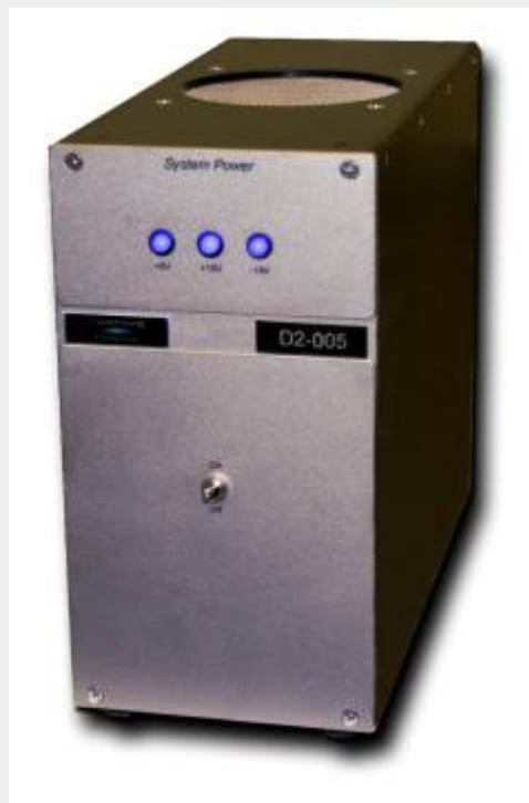
D2-005 Power Supply