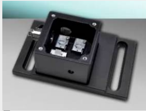
D2-150 Heterodyne Module

Please read Limited Warranty and General Warnings and Cautions prior to operating the D2-150.