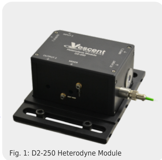
Fig. 1: D2-250 Heterodyne Module

The D2-250 heterodyne module is designed to provide a fiber-coupled heterodyne optical beat note formed by picking-off a small proportion of light from each of two laser beams. Light is coupled into a multi-mode fiber. A second output port can be used to align the overlap the two picked-off beams. The light entering the module should be linearly polarized in either vertical or horizontal direction for best results.